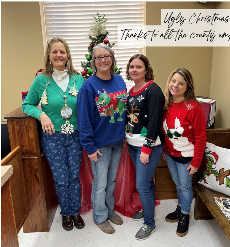
Ugly Christmas Sweater Day Thanks to all the county employees who participated!

Addiction 800-889-9789 Upper Cumberland 931-528-1127