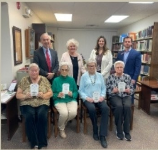
Wilson Co. Archives Volunteers