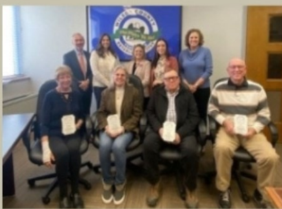
Wilson Rides, Inc.