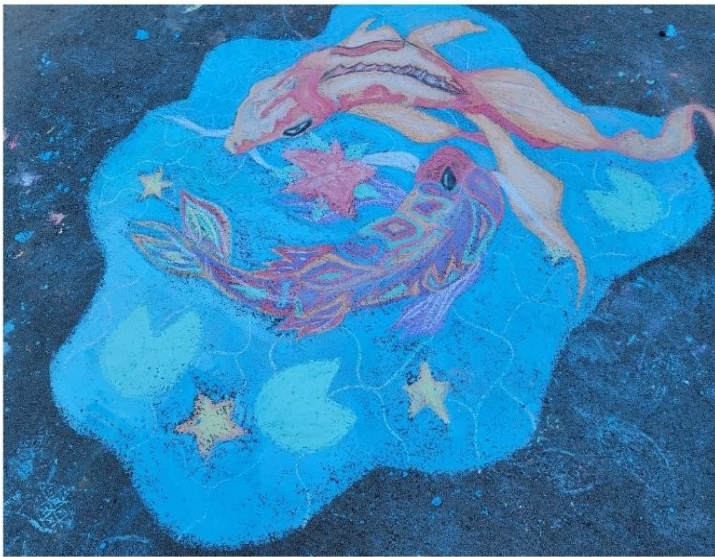
1ST PLACE: THREE MUSCATEERS)

The Fite-Fessenden house garden was the perfect setting for music and refreshments before the awards ceremony. They invite the public to visit and tour the renovated home and garden. Cumberland University Community Arts Council looks forward to continuing their mission to bring art to the Wilson County community and to encourage participation.