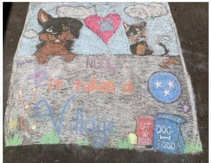
4TH PLACE: NEW LEASH ON LIFE