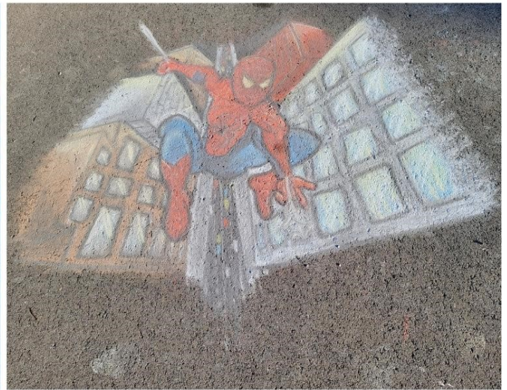
2ND PLACE: CAMERON BRYAN