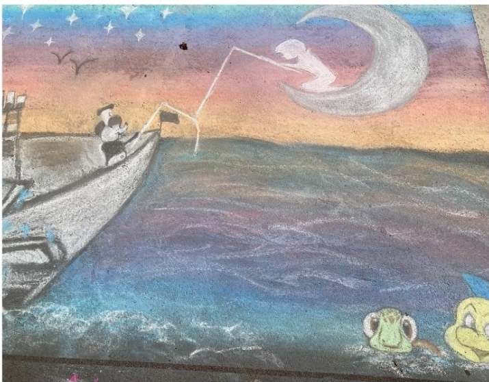
3RD PLACE: PHOENIX FLAIRS