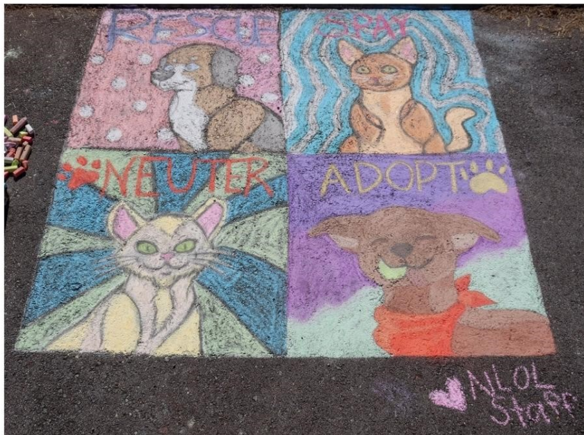
NEW LEASH ON LIFE TEAM PEOPLE'S CHOICE: CATEGORY 4